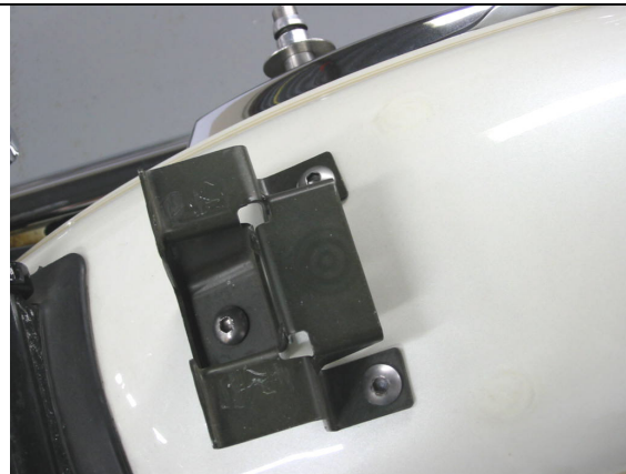
#4. Remove original passenger seat attachment bracket from the rear fender -

#3. Your new passenger seat has the connecting bracket already installed. Do not remove the connecting bracket from the passenger seat.