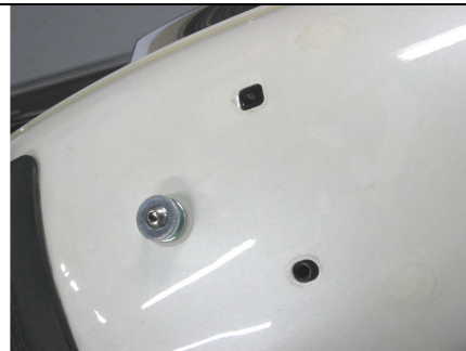
#5. Install the supplied spool – using the supplied screw (4mm Hex key) into the center threaded hole in the fender where you removed the original bracket. The nylon washer must be under the spool, between the spool and the fender.

#6. Now you can install the Ultimate passenger seat, the front passenger seat bracket goes over the spool and then slides forward to lock in.